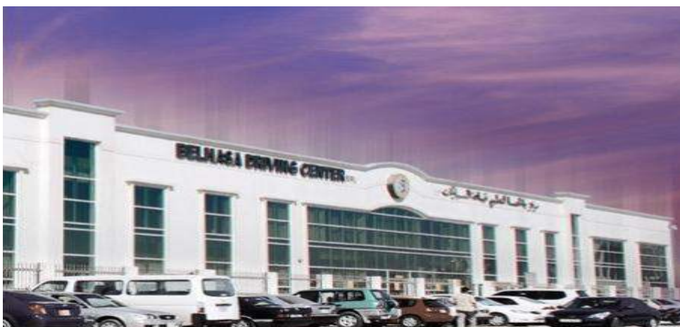
BELHASA DRIVING SCHOOL- NAD AL HAMAR